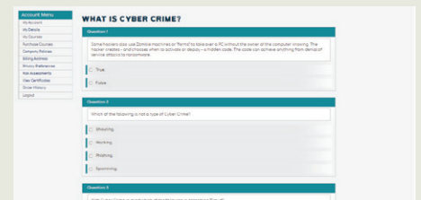
Final exam - certificates provided.

Unfortunately, cyber crimes are becoming increasingly prevalent. The consequences can be catastrophic, especially in terms of cost, loss of data and liability.